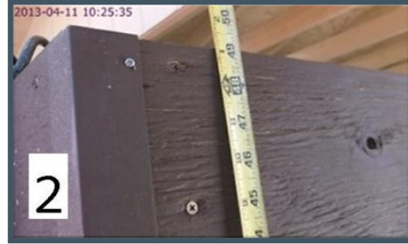
2 Photo showing the HEIGHT of the container