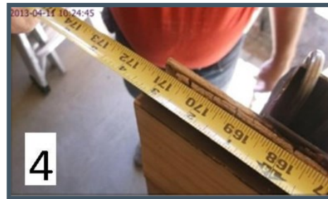
4 Photo showing the LENGTH of the container