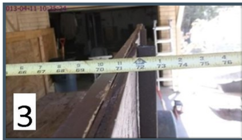
3 Photo showing the WIDTH of the container